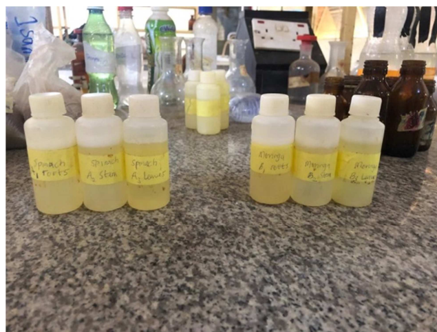
Figure 3. Prepared Samples Ready for Analysis.

The vegetable samples (spinach and lettuce) were thoroughly rinsed under running tap water and then with distilled water to eliminate dusts, pesticides, fertilizers, mud and any airborne pollutant that may be present. The roots, stem, and leaves of the plant samples were cut into pieces separately and 2g of each plant samples (Moringa Oleifera and Spinacia Oleracea) was mixed with 10ml of Nitric acid (HNO 3 ) and heated at 95°C to a reduced volume and cooled, and then filtered using filter paper. The filtrate was made up with distilled water to 50ml and stored for further analysis.