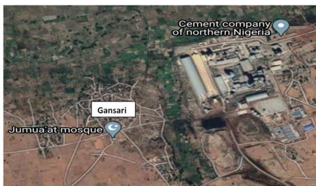
Figure 1. Map of Sokoto State showing Cement Company of Northern Nigeria and Gansari Village.

Sokoto State is located in the extreme Northwest of Nigeria, near to the confluence of the Sokoto River and the Rima River which has an estimated population of more than 4.2 million. Gansari village is in Wamakko LG of Sokoto state, the host of the Cement Company of Northern Nigeria located at approximately 20 – 30 meters from the village.